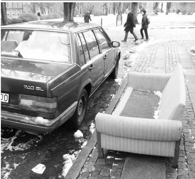
Above: "The Streets of Lund" (No.100) Right: AF-Borgen, the Student Center